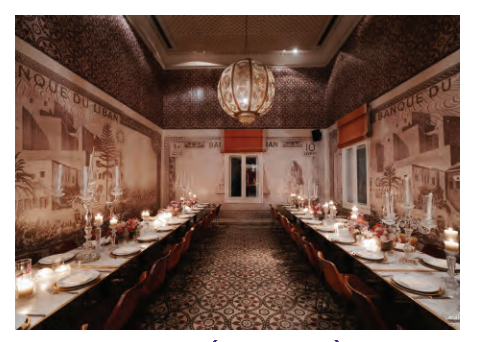
MONEY ROOM (50 PERS)