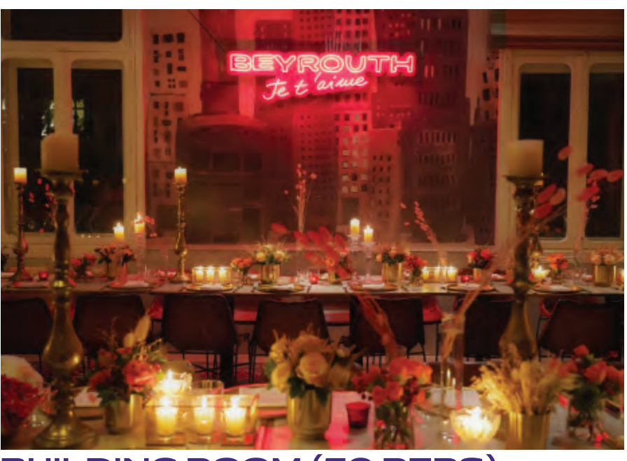
BUILDING ROOM (50 PERS)