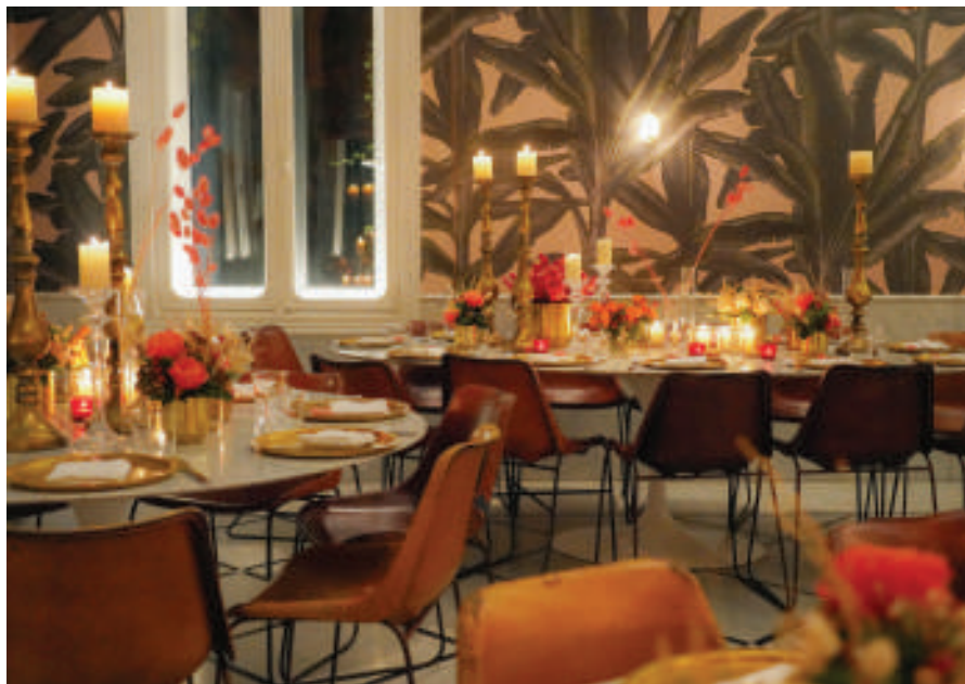
BANANA ROOM (26 PERS)