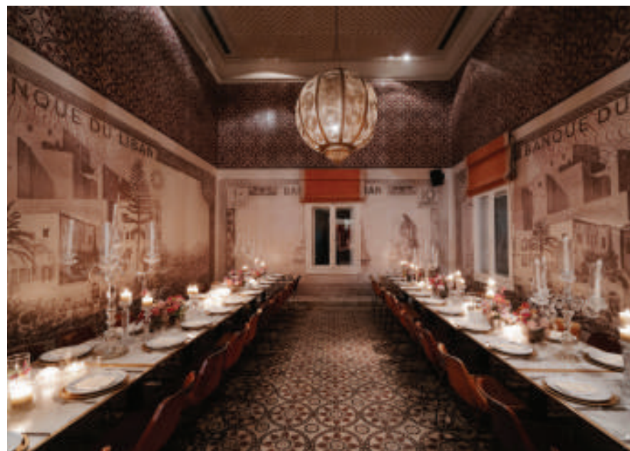
MONEY ROOM (50 PERS)