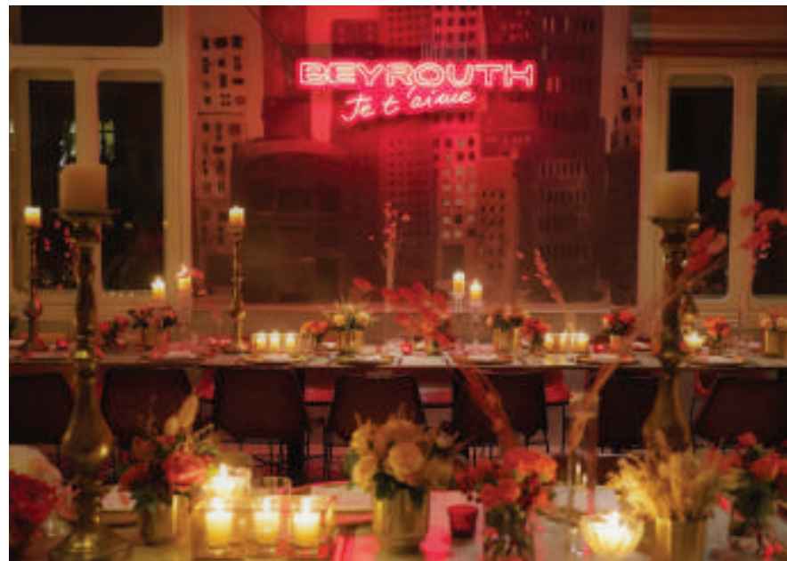
BUILDING ROOM (50 PERS)