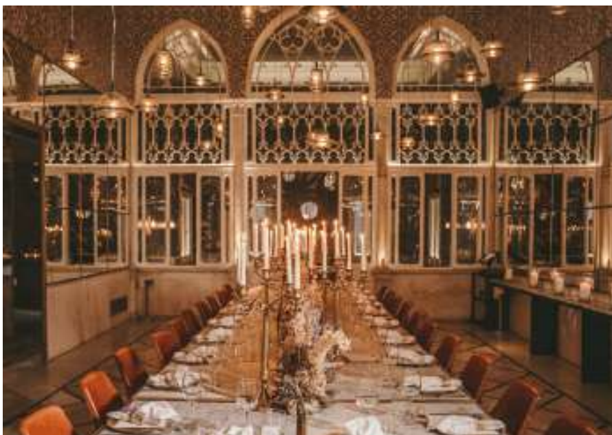
MAIN ROOM (60 PERS)