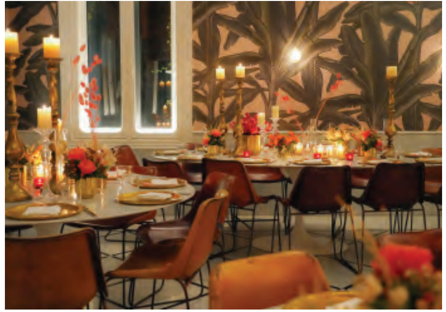
BANANA ROOM (26 PERS)