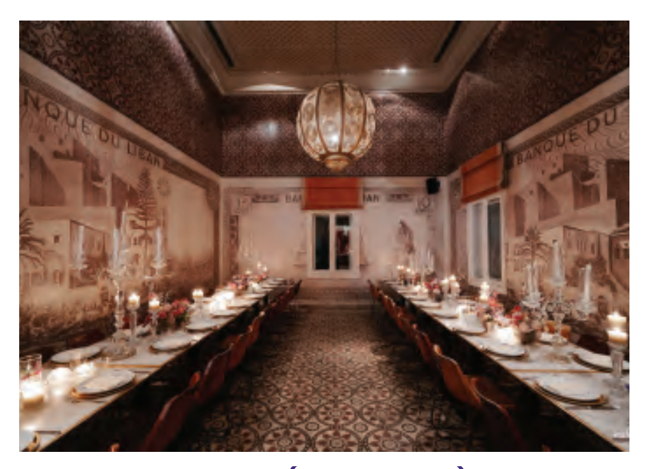
MONEY ROOM (50 PERS)