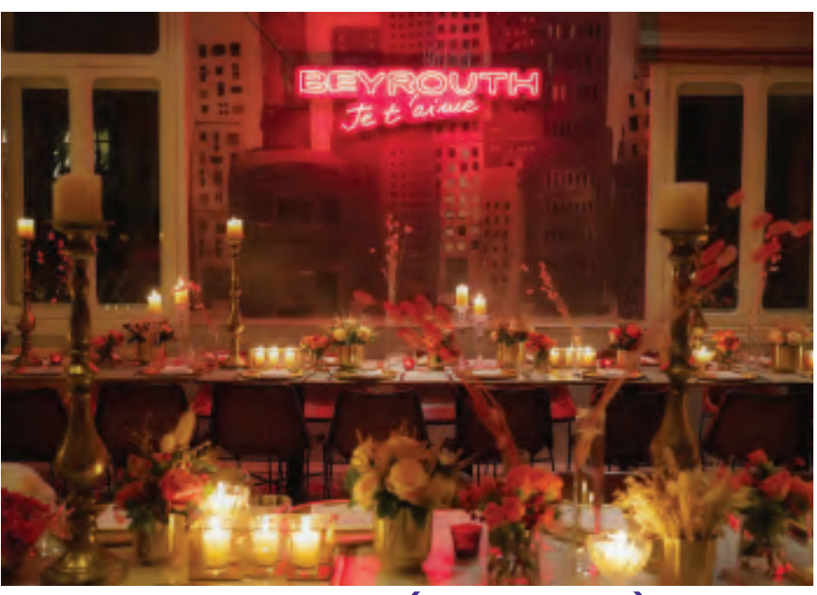
BUILDING ROOM (50 PERS)